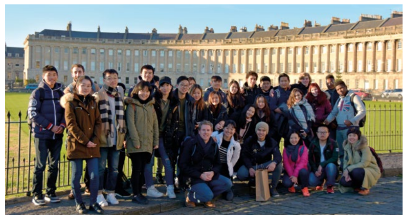
A trip to the Royal Crescent, Bath

Previous visits include London, Bath, Stonehenge, Stratford Upon Avon and Windsor. Our social programme gives international students the opportunity to experience the uniqueness of British culture and history.