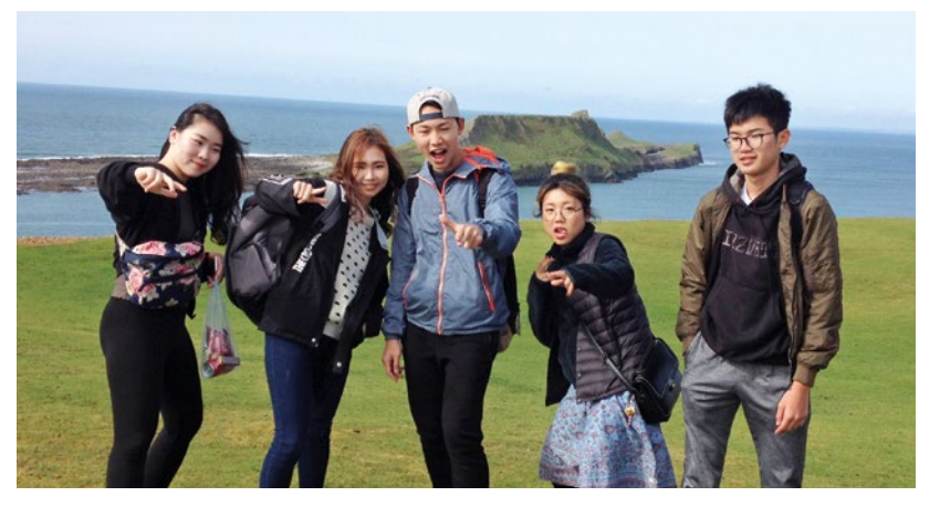
International students enjoying the beautiful Rhossili Bay, only a 30 minute drive from Swansea city centre.