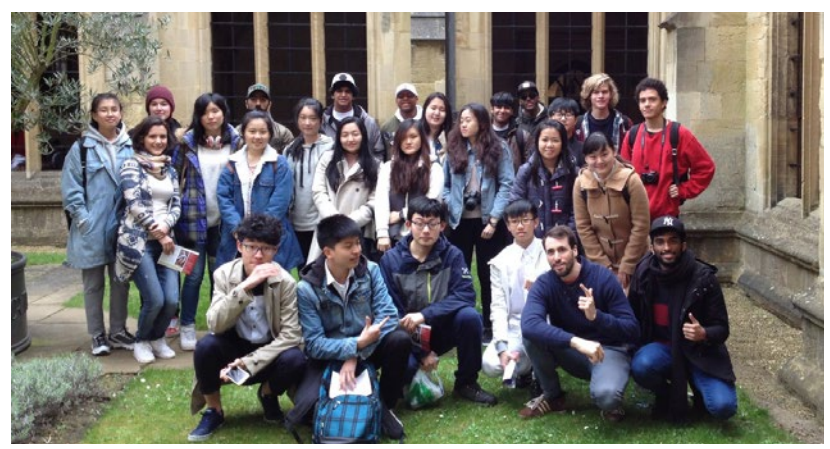
International students at Magdalene College, University of Oxford