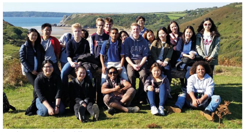
Students visit Three Cliffs Bay, Gower